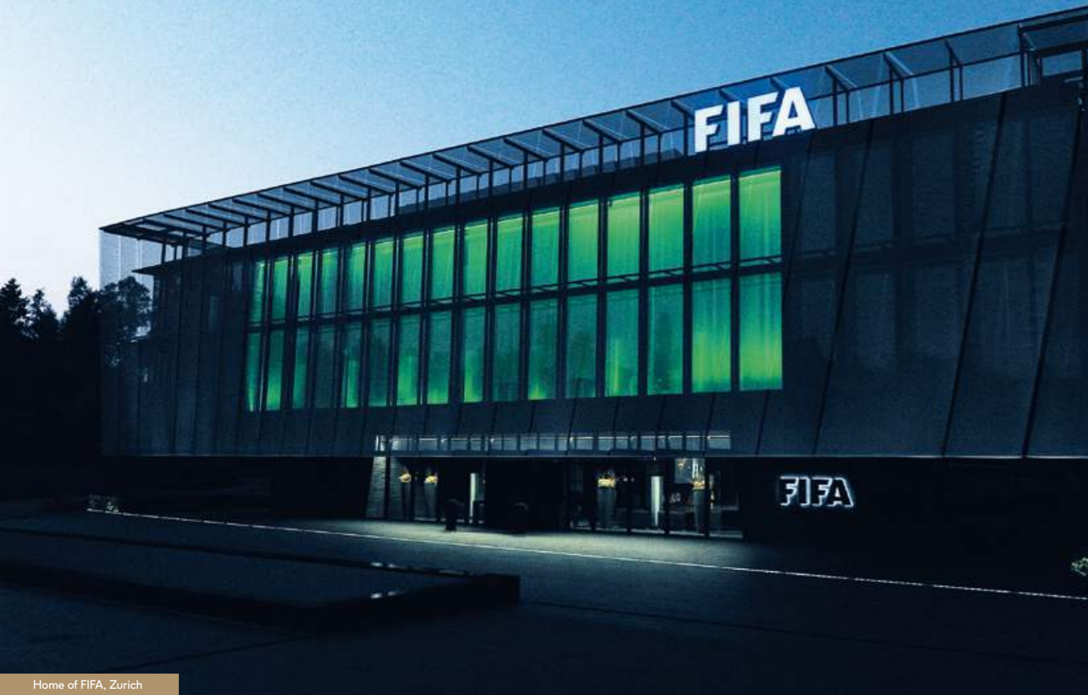
Home of FIFA, Zurich