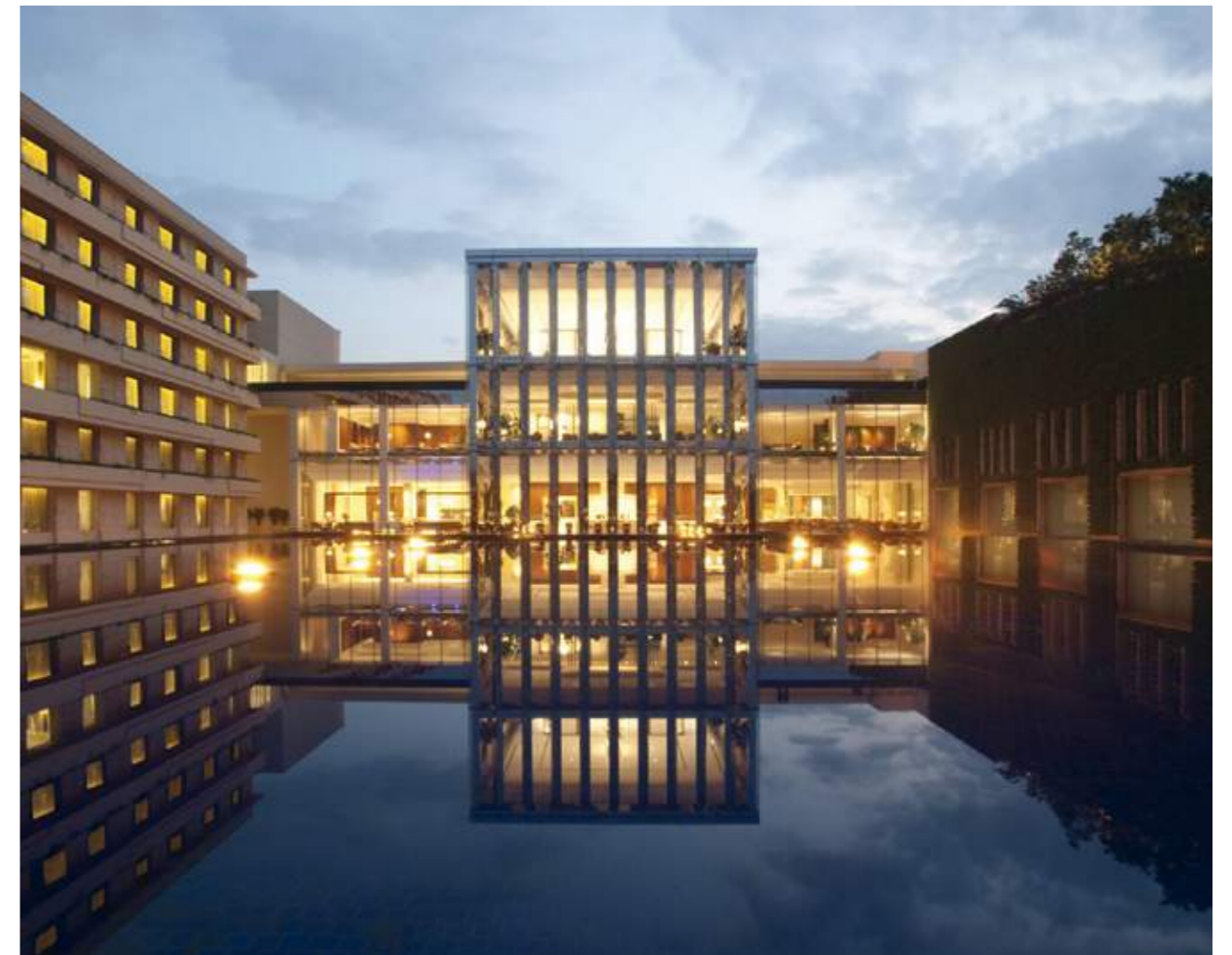
The Oberoi, New Delhi