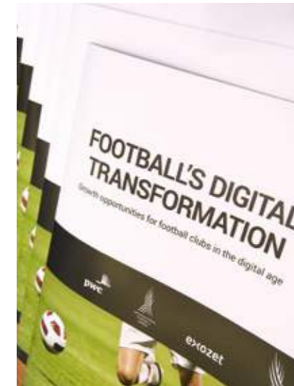
Digital Report by PwC, Exozet, IFA