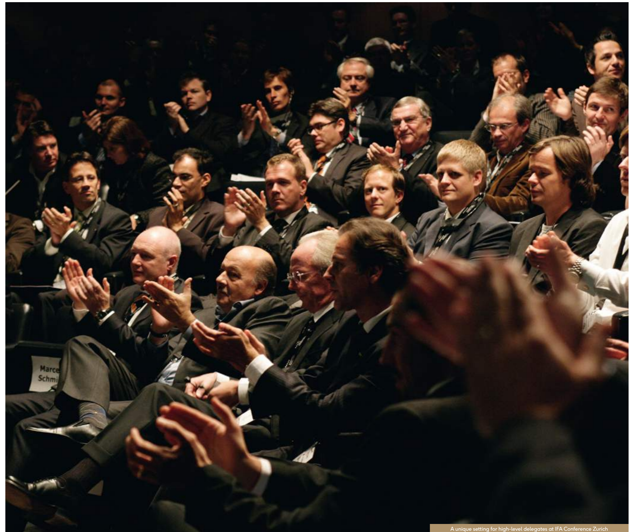
A unique setting for high-level delegates at IFA Conference Zurich

It is our ambition to create a unique setting for delegates to meet one another on a regular basis in order to address relevant topics. However, we intend in future to distribute more content to social media, thereby giving the fans a chance to follow the discussions and presentations of the leaders in our world of football.