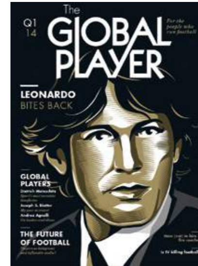
IFA's jubilee magazine 2013/14