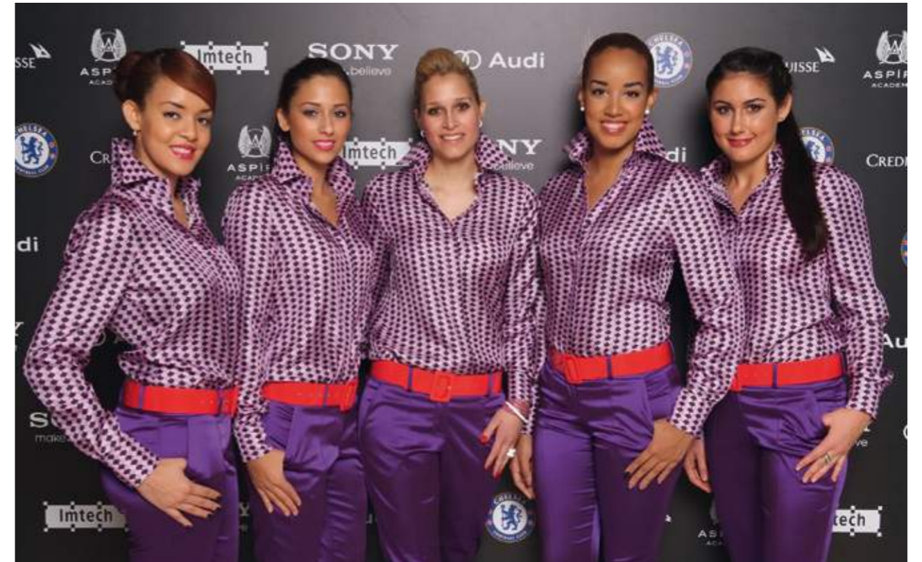
VIP hostesses playing their part at IFA Conference Zurich in 2012

And of course, luxury brands feel at home and find potential customers in such an exclusive environment. In the course of 16 years we have formed partnerships with these companies.