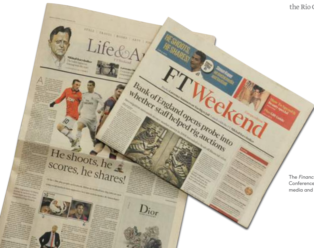
The Financial Times reviews the IFA Conference Berlin and runs a story on social media and football by Simon Kuper.

as well as IFA newsletters, while solid products with a long-term focus are to cater to other needs for information - the glossy magazine The Global Player , for example, or the specialist report drawn up in co-operation with Pricewaterhouse-Coopers and Exozet. The Financial Times has covered IFA Conferences on several occasions, such as the Berlin Conference in 2014. And there has been an event-partnership for the Rio Conference in 2013.