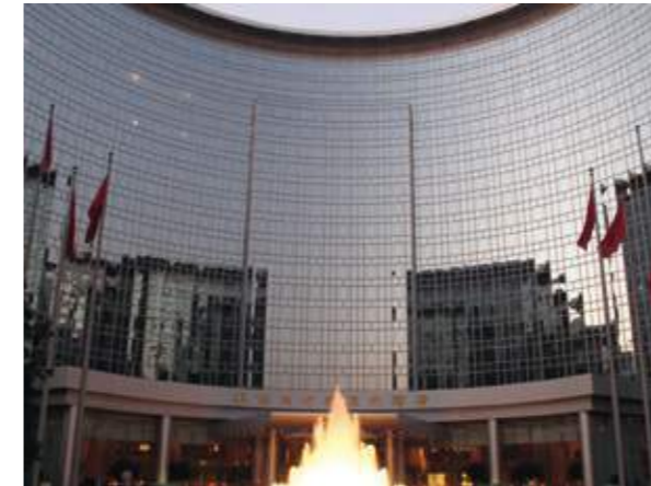
Grand Hyatt, Beijing

Five-star quality has always been a must in partnering with hotels or conference facilities. And many times, the FIFA management have generously opened their doors at the “Home of FIFA” in Zurich to welcome our community.