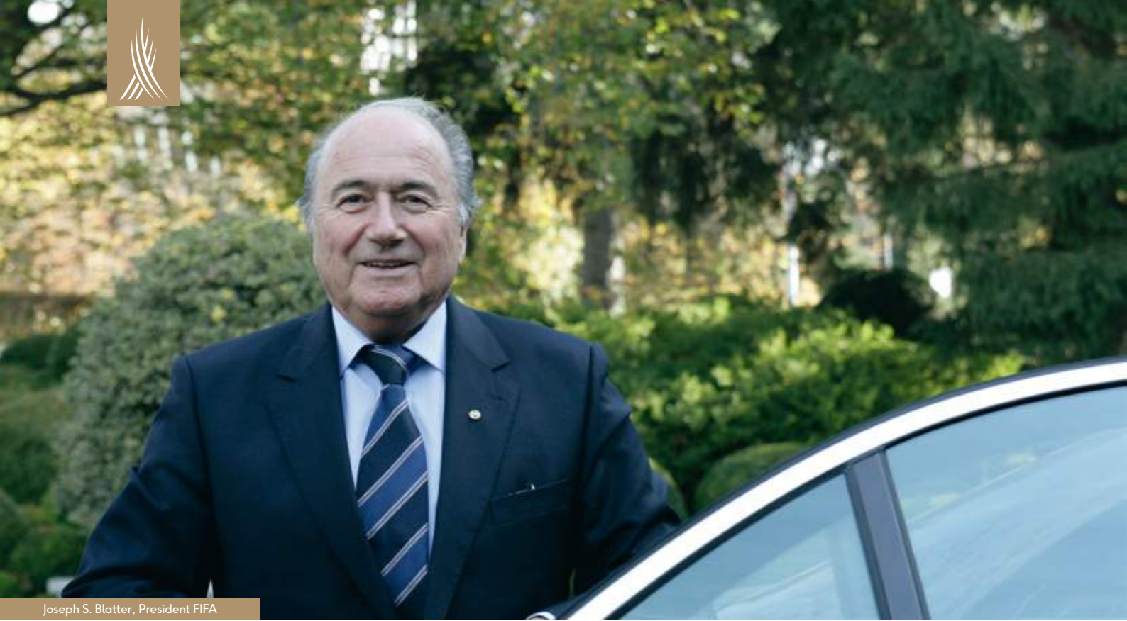
Joseph S. Blatter, President FIFA