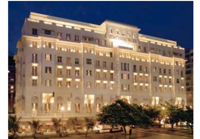
Copacabana Palace, Rio de Janeiro